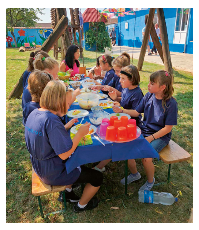
Children from the children's home and the daycare centre in Romania

Now, as part of the District Apostle Meeting in May, there was a campaign to create a little joy for the boys and girls and make their day. The church's multi-purpose rooms were converted into an art studio for this purpose. Light blue T-shirts and yellow fabric paint were provided for the wives of the District Apostles and their assistants. They had a great deal of fun painting smiley faces on the T-shirts, hoping to bring big smiles to the children's faces in Romania.