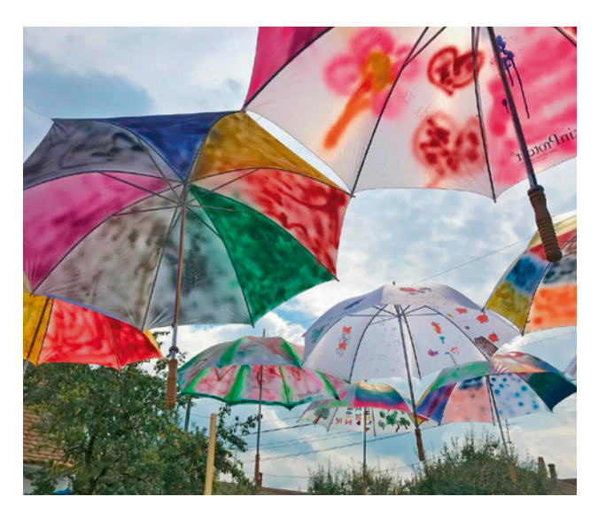
Festivities to mark the takeover of the Casa Pinocchio children's home

25 to 30 children from socially disadvantaged families were cared for here after school; today there are around 40 children. The children receive a warm meal, they can play, and receive help with their homework. But there is more to it. The caregivers aim to pass on values to the children and prepare them for a good life in society. For example, they helped the children develop a disability etiquette by inviting wheelchair users to the daycare centre. These people told the children about their life stories and even taught them how to manoeuvre in a wheelchair.