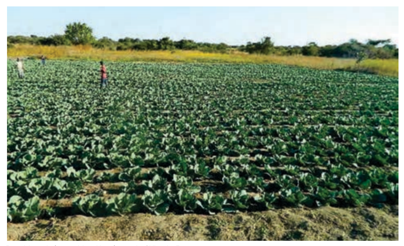
Part of the agriculture activity taking place at the Chibombo Farm.

The development of the farm is being funded by New Apostolic Church - Zambia and Nak karitativ (NAC International Relief Organisation) who have so far invested over Euros 150,000.00 in the farm. The farm has several sections under which the above mentioned developments are being implemented.