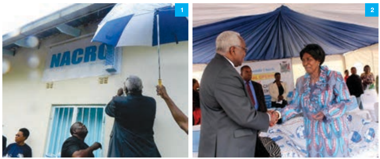
District Apostle Charles Ndandula unveils the new name for Henwood Foundation (NACRO) on December 19, 2015 at Lima Garden Lusaka.

The Foundation's activities are anchored on humanitarian support and promotion of programmes aiming at improving the livelihood of the less privileged and vulnerable people in the communities. Henwood Foundation serves New Apostolic Church members and non-members in the communities where the church operates without any form of segregation or preference.