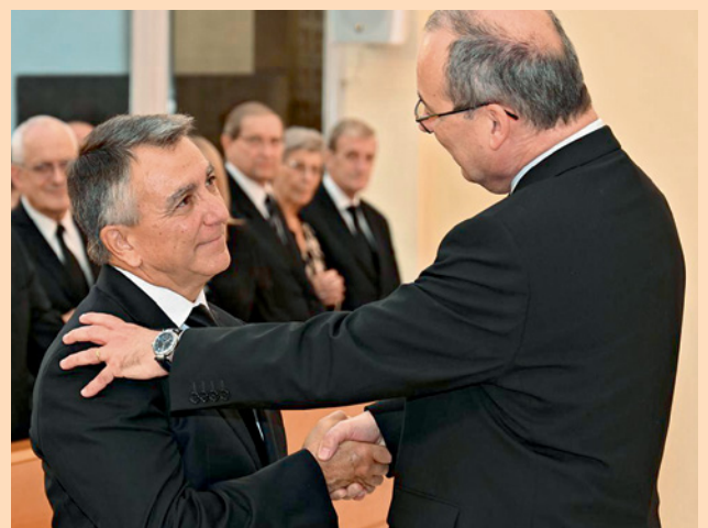
NAC South America

The new District Apostle Helper was born on 16 March 1966 in Colonia del Sacramento in Uruguay and grew up in a New Apostolic home. He was ordained as a Subdeacon in 1985, his first ministry. He was ordained an Apostle in 2011 and has been responsible for the New Apostolic Christians in Uruguay since then. He is married and has one daughter.