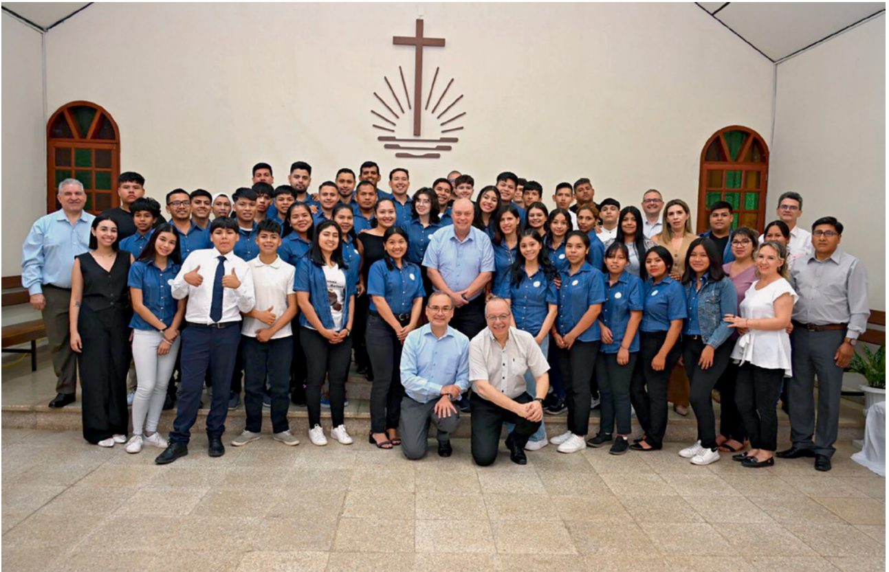
NAC South America