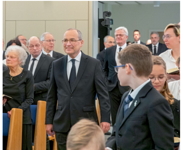
The Chief Apostle conducted a divine service in Spreewald in Germany on 12 January 2025

“He who observes the wind will not sow.” The Bible text refers to the image of a farmer who refrains from sowing in windy conditions so that the seed is not carried away. “Sowing in the Bible is often used as an image for our way of life,” the Chief Apostle said. “The wind is an image for all the things that make sowing difficult.”