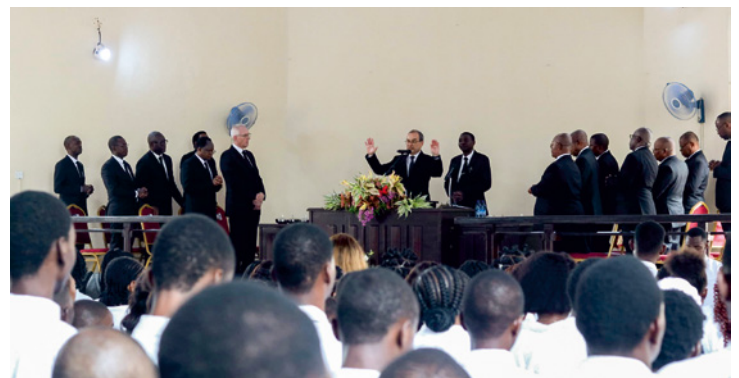
Music enhanced the worship experience