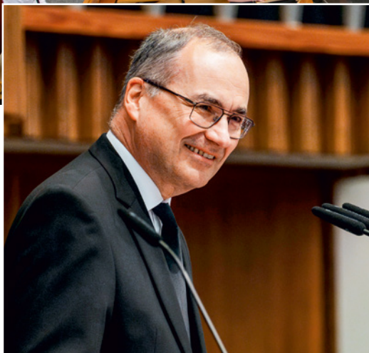
On Pentecost, Chief Apostle Jean-Luc Schneider conducted a divine service in Wiesbaden, Germany