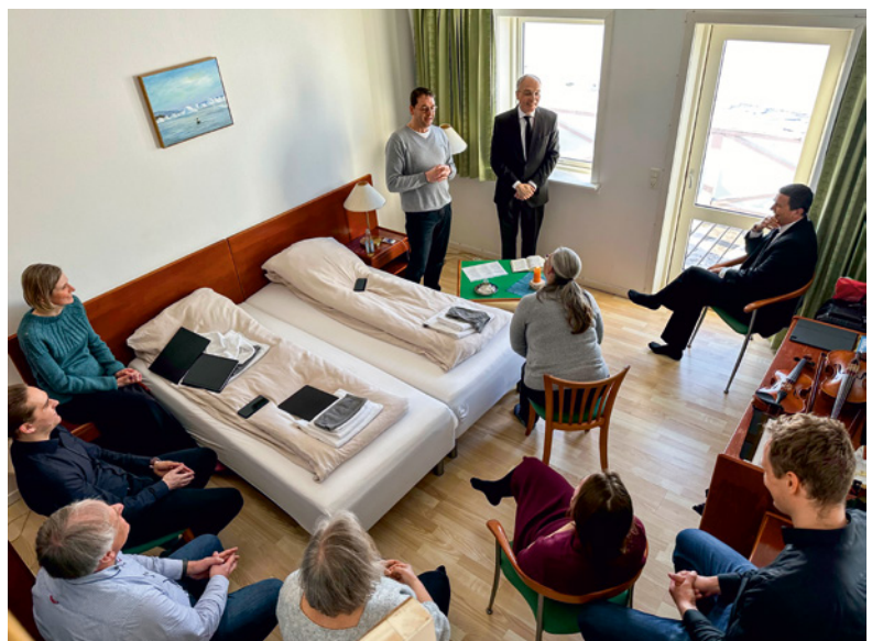
Divine service with a sister in Ilulissat in Greenland

Love for God and our neighbour, as well as our shared faith and our principles of faith, our expectation of the return of