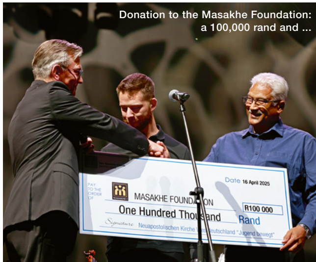
Donation to the Masakhe Foundation: a 100,000 rand and ...

The divine service in Tafelsig, South Africa was accompanied by 300 musicians from Western Germany, who were joined by several instrumentalists from Cape Town